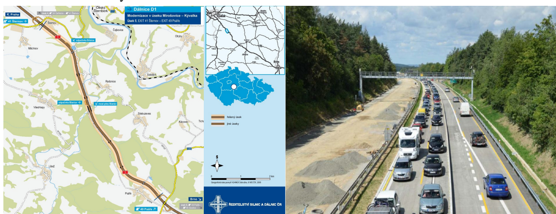
Fig. 1. Location of estimated reconstruction project and 2 + 2 traffic lane arrangement during work

As mentioned above, for the purpose of this research an extensive set of unique data from already completed reconstruction project ("Section 05" at kilometres 41-49 of the backbone Czech highway D1, see Fig. 1 below) was gathered. These data were not only of a generally available kind, e.g. on air pollution in the monitored area or statistics of the Czech or European Statistical Office, but in particular project documentation, technical report and traffic engineering measures of the project, which are essential for the user costs' estimation. Due to the large volume of data and performed calculations, this paper does not provide its full extent, but outlines the method and lists the summarized results only.